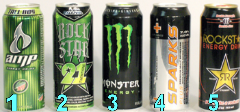
1-amp (non-alcoholic); 2-Rock Star 21 (alcoholic); 3-Monster Energy (non-alcoholic); 4-Sparks (alcoholic); 5-Rock Star Energy Drink (non-alcoholic)