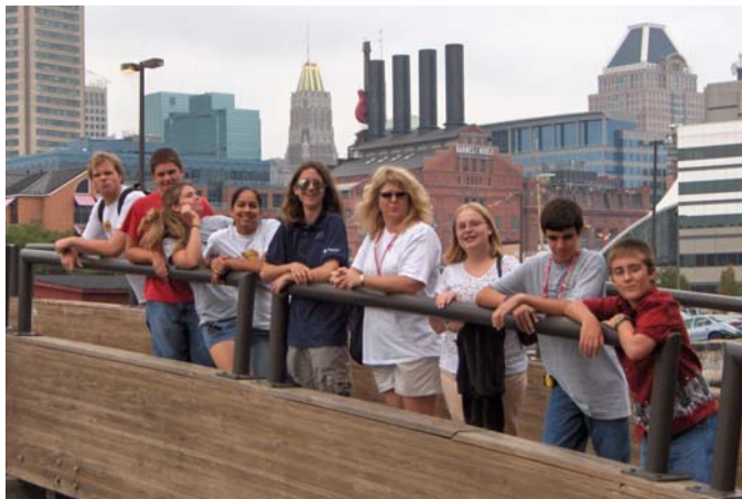
Attendees at the Inner Harbor in Baltimore.

Throughout the year, PACT staff and members have the opportunity to attend one of several conferences and workshops. Members wishing to participate are not required to be a member of the substance abuse sector, only a desire to grow and learn.