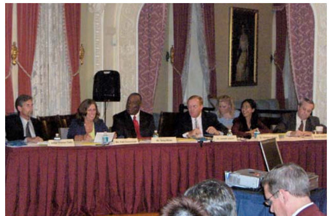
Town Hall 2005: This Place...St. Johns County

As part of the partnership between PACT and its fiscal agent, EPIC Community Services, Inc., the coalition funds the Olweus Bullying Prevention Program. This program is a best practice model designed to prevent youth substance abuse by addressing the issue of bullying, a precursor for future substance use problems. The program creates a change in the school climate and provides intervention for youth and families. Since its first year, 2005-2006, three middle schools have participated.