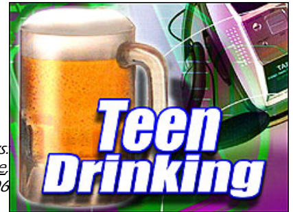
First Coast News. Teen Drinkers Beware May 2006

PACT and the St. Johns County Sheriff's Office announcing the commencement of summer underage drinking details. As a result, PACT and the Sheriff's Office were recognized for their collaboration in the Weekly Update of the Leadership to Keep Children Alcohol Free, which is distributed nationally.